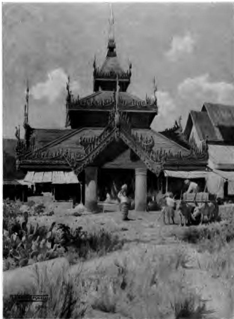
A REST HOUSE.